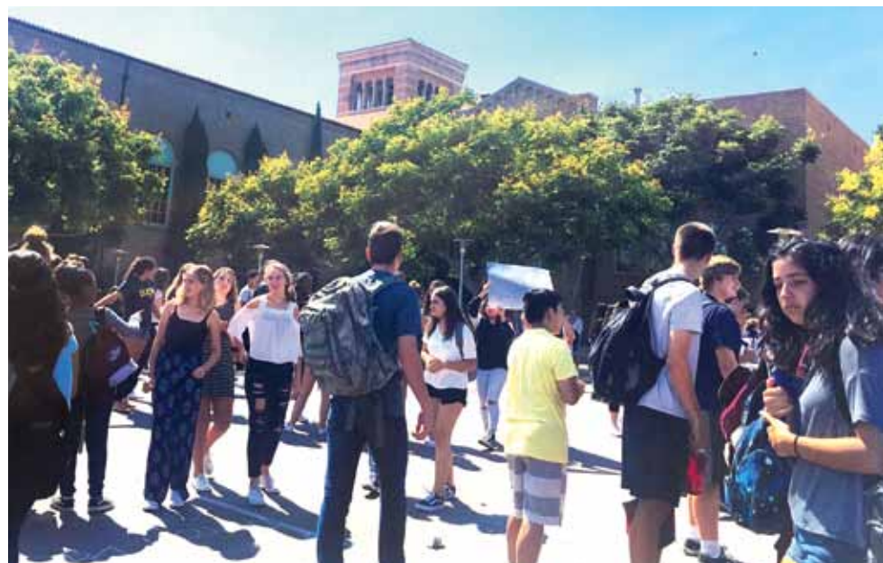
Students enjoying the Club Fair.